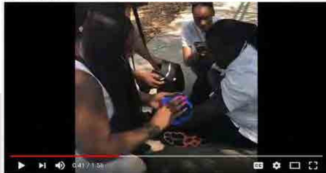
SYEPA Stop the Bleed