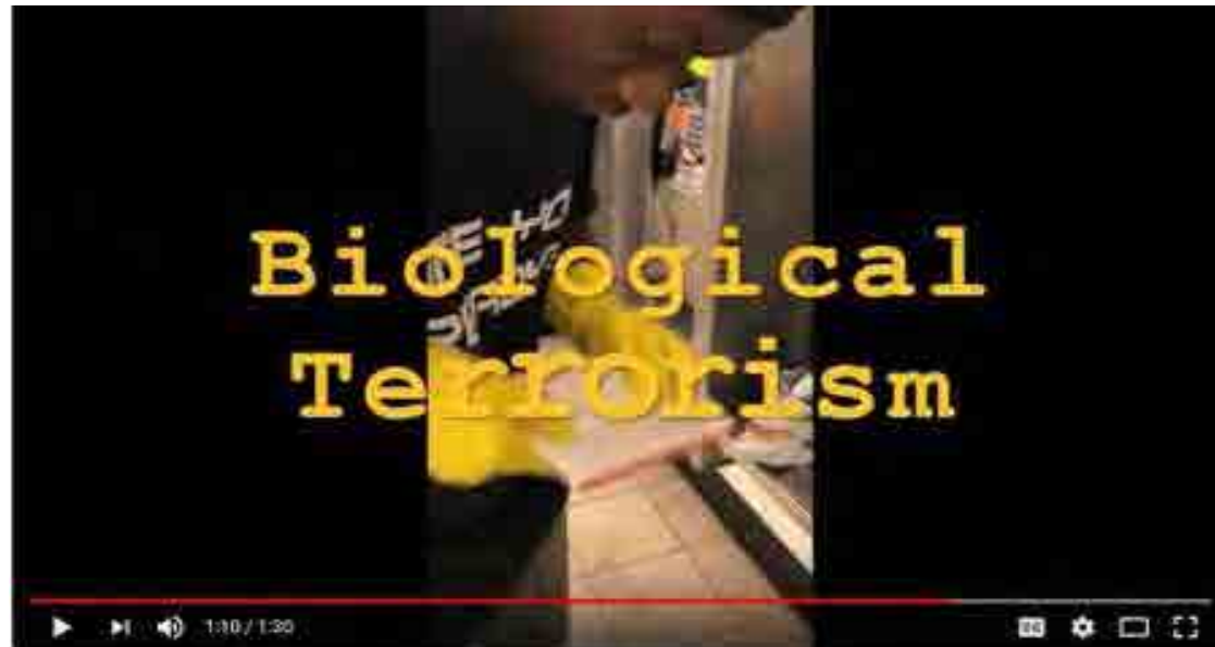
SYEPA Terrorism PSA

Students took leadership in creating Public Service Announcements (PSA) that showcased safety protocols. The purpose of the PSA is to encourage emergency preparedness to the community. The videos focused on Cardiopulmonary Resuscitation (CPR), Automated External Defibrillator (AED), Stop the Bleed, and eight types of terrorism.